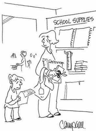
"...and right after scissors comes first aid kit."