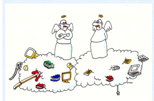
CLOUD COMPUTING "I'd prefer it if they stored their stuff someplace else!"