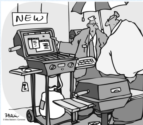
“Now you can surf and turf.”