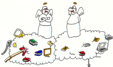
CLOUD COMPUTING "I'd prefer it if they stored their stuff someplace else!"

It is quickly becoming unnecessary for some businesses to purchase and maintain an on-site server. Now companies can host one or more of their applications, data, e-mail, and other functions "in the cloud." That simply means it's stored off-site in a highly secure, high-availability "utility" company that has far more power and resources than you could ever logically have on-site as a small business. With devices getting cheaper and Internet connectivity exploding, cloud computing is suddenly a very smart, viable option for small business owners.