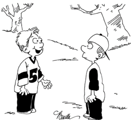
"You know what I just noticed about playing outside? No pop-up windows."