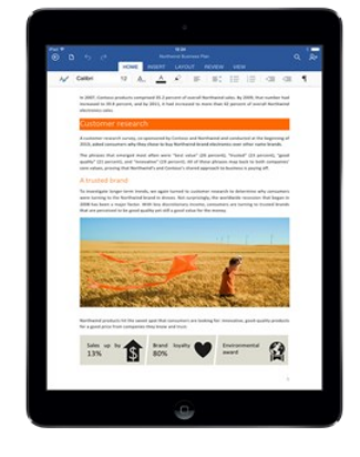
Used with permission from Microsoft.