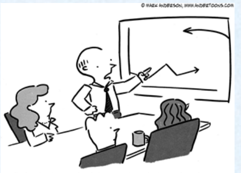
"Oh, that? We don't know what that is. The plan is to just ignore it and hope it goes away."