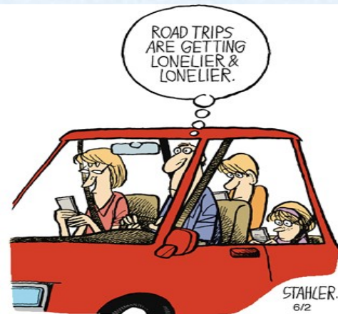
©Jeff Stahlter/Distributed by Universal Uclick for UFS via CartoonStock.com

Protect your server and computer equipment from frying with our FREE "Beat The Heat" Network Audit. Schedule your "Beat The Heat" Audit today by calling our office at 240-880-1944. Offer Expires 8/31/14.