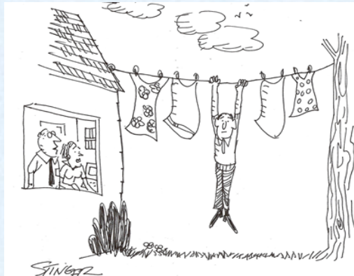
"How often does he go online?"

A Pleasant Drive With The Queen Of England..... Page 4